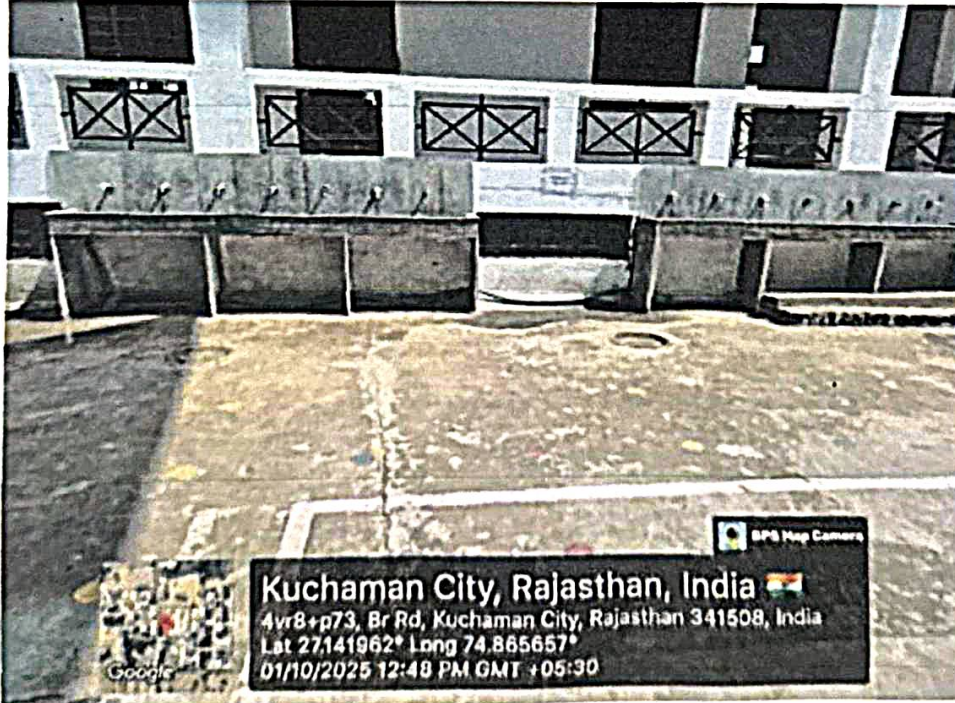
Safe Drinking Water

For B. R. Khokhar Memorial Shikshak Parshikshan Mahavidyalaya